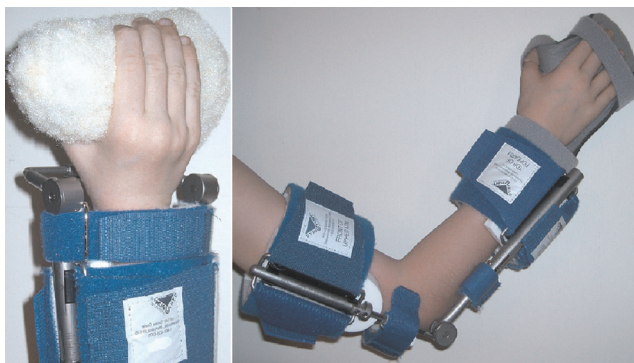
Figure 1 Paediatric wrist extension Dynasplint and elbow extension Dynasplint

A wrist extension Dynasplint system was prescribed for this patient initially. After success was seen with that unit, an elbow extension Dynasplint was prescribed later (Figure 1). The patient's caregiver and treating occupational therapist were given instructions for use of the neurological Dynasplint system and its protocols by the Dynasplint specialist during the initial and follow-up visits. The initial visit included customized fitting of the